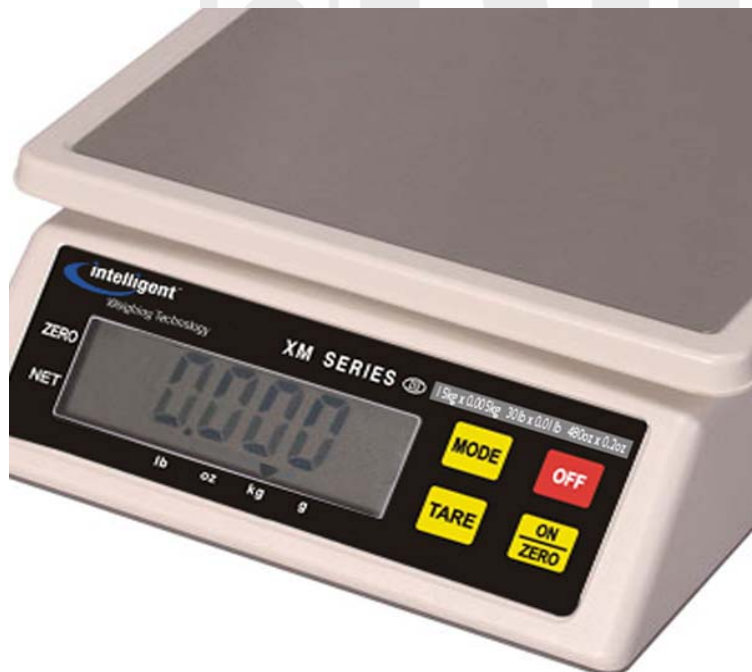
Model XM Series